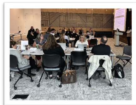
Policy Advisory Group Meeting at the Clifford L Allenby Building in Sacramento on September 18, 2024

The final PAG meeting will be held on November 20, 2024 , and is open to the public.