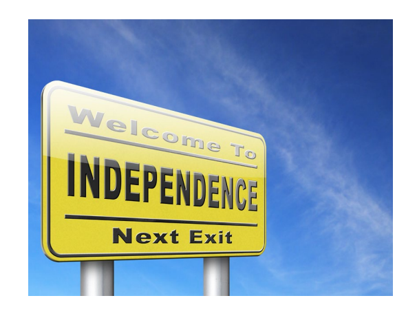
You can get more independence and self-confidence