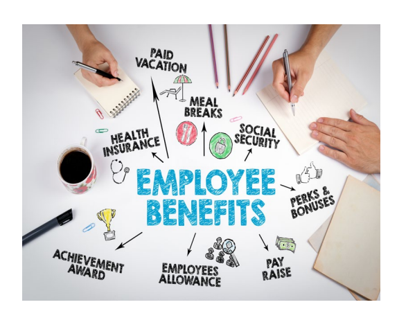
You get more money for a vacation and more health benefits