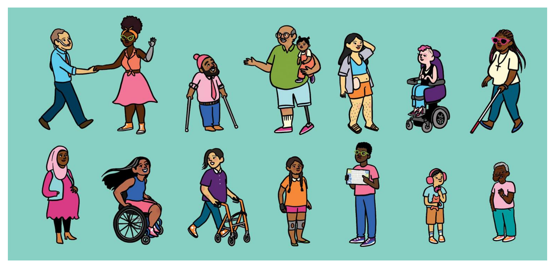
DACLAC – February 14th, 2024