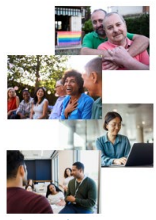
California Caregivers + Family Adults 40+

Multicultural, Latino, Black, AANHPI, LGBTQ+